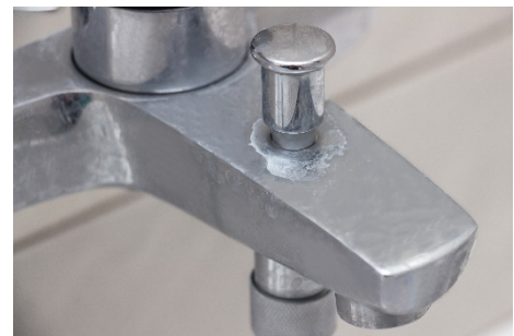
Mineral scale on water faucet

This may result in a small increase in the amount of "scaling" on equipment/appliances—the white, naturally-occurring mineral that can be seen after water has dried (see photo at right). In particular, customers may notice a small amount of additional scale develop over time where hot water is in contact with fixtures and appliances, such as hot water heaters, dishwashers, and showerheads. Follow the manufacturers' directions for care and maintenance of these appliances.